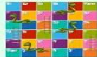
SNAKES & LADDERS