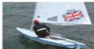
Don't go on the other side

Pull in the sheet a bit before you start and use a bit of roll so you have really good speed as you come out of the gybe. As the main comes off the masthead, give it a short sharp jerk. Push the boom across with your hand to speed things up still further (unless there's plenty of wind come out of the gybe quite high to help the boat accelerate overall, turn smoothly through a big angle).