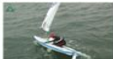
Watch the boom across