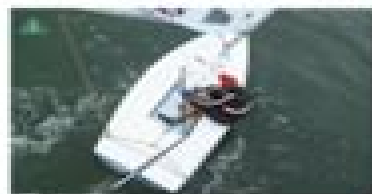
Begin to catch a wave

It's vital to pick the right wave to gybe on. Sometimes, even though you're surfing, you don't want to gybe because you're coming to the end of the wave. The best time is as you catch a wave, or if you think you can catch the wave by roll gybing.