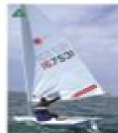
Begin to roll the boat