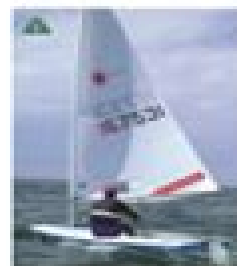
That's the point to let

In the middle of the gybe keep your body weight in the same position and the boat will roll over on