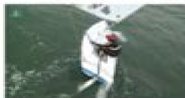
Don't roll the boat