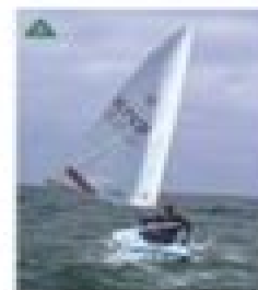
Come out of the gybe quite high