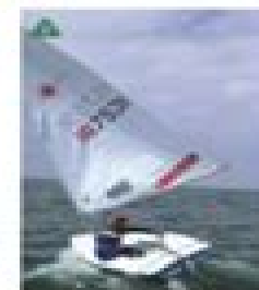
Don't roll the boat