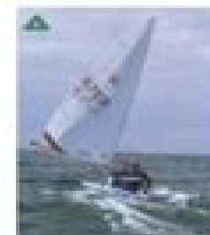
Don't roll over onto the other side

top of you. Use your front hand on the boom to keep on. Sheet in a little bit more, and choose the right moment to cross the boat. As you go, push the boom across with that same front hand.