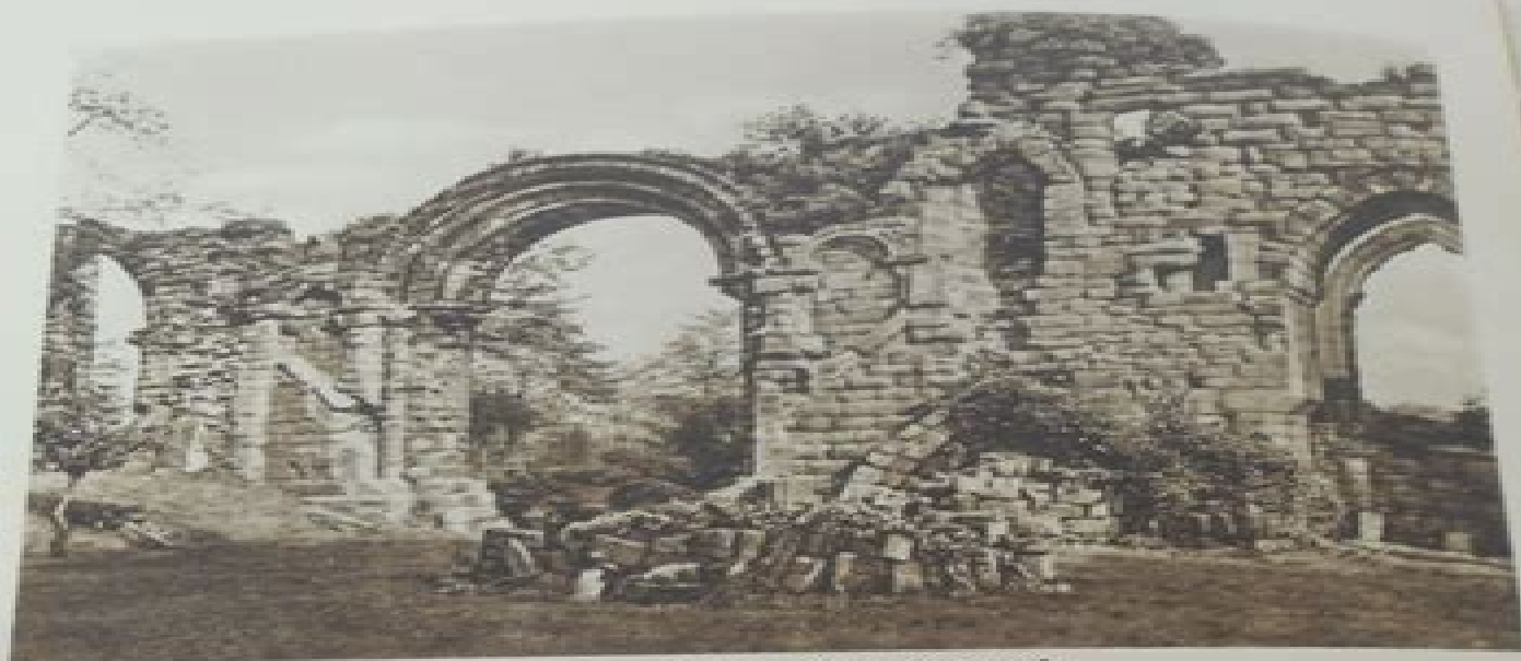
Ruins of the Old Church