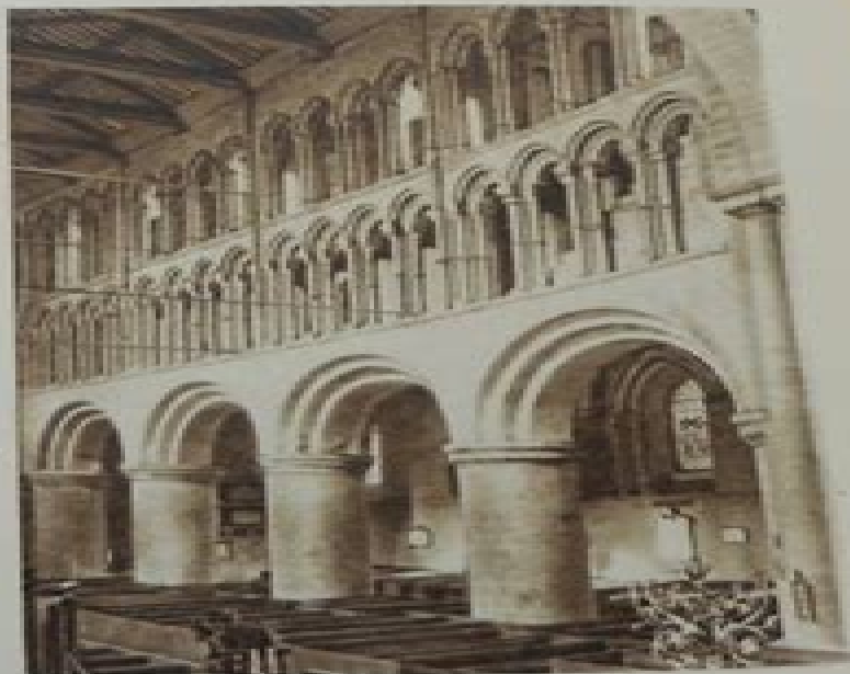
The Massive Norman Pillars and Lovely Arcading CHESTER'S OLD CATHEDRAL CHURCH OF ST JOHN