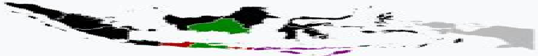
Results by electoral district

Leader Abdul Wahab Hasbullah Aimin Party NU PKI Seats won 45 39 Popular vote 6,955,141 6,176,914 Percentage 18.41% 16.35%