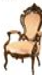
Revival Furniture 1800-1900AD