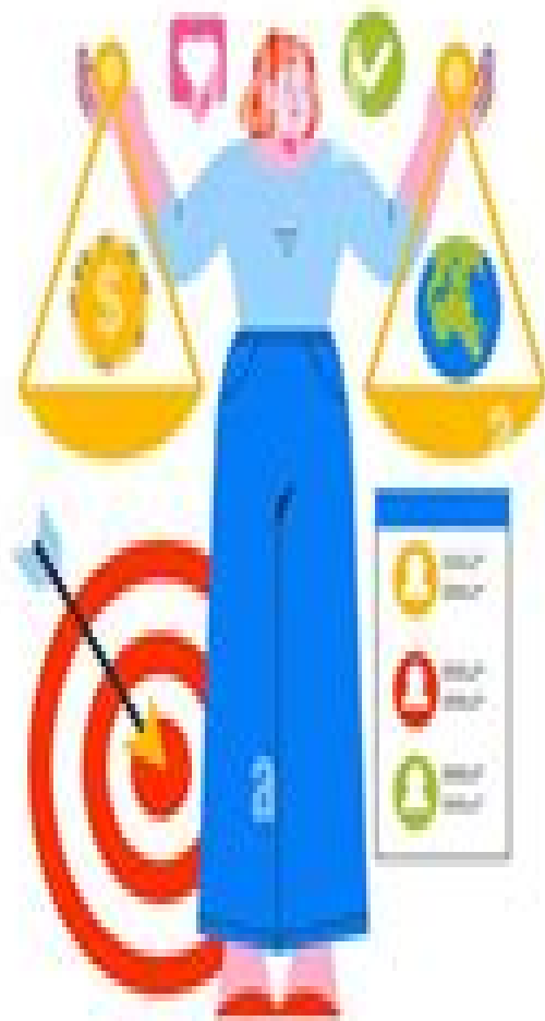
Social Media and Trends