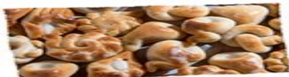
PGI Toledo Marzipan