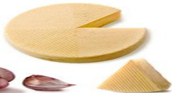
From Las Pedrozuelas