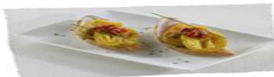
PGI Berenjenas de Almagro