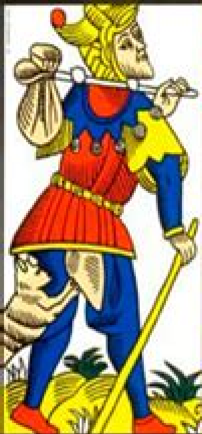
DER NARR EL LOCO