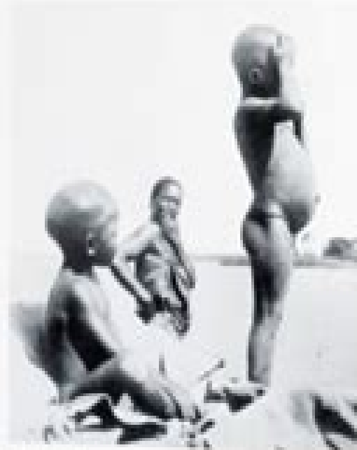
At the beach, 1911.