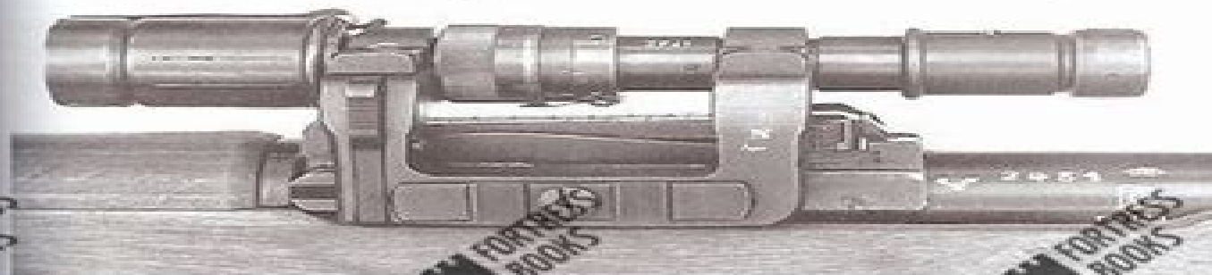
Abb. 1.25 Mauser: Linker und rechter Seitenansicht eines Gewehr 98k mit einem Fernglas. Der Gewehr 98k ist ein kürzeres Gewehr, das die gleiche Mechanik wie der Gewehr 98 hat, aber eine andere Form hat. Die Gewehr 98k ist ein kürzeres Gewehr, das die gleiche Mechanik wie der Gewehr 98 hat, aber eine andere Form hat.