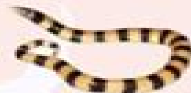
Jan's Banded Snake