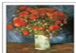
VAN GOGH Poppies