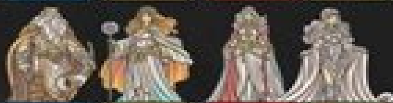
DAHBOG LADA ZORYA MOKOSH