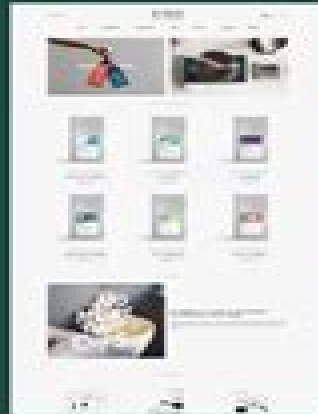
FOOD & DRINK Detour Coffee