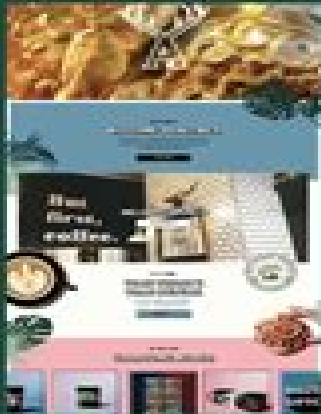
FOOD & DRINK Alfred