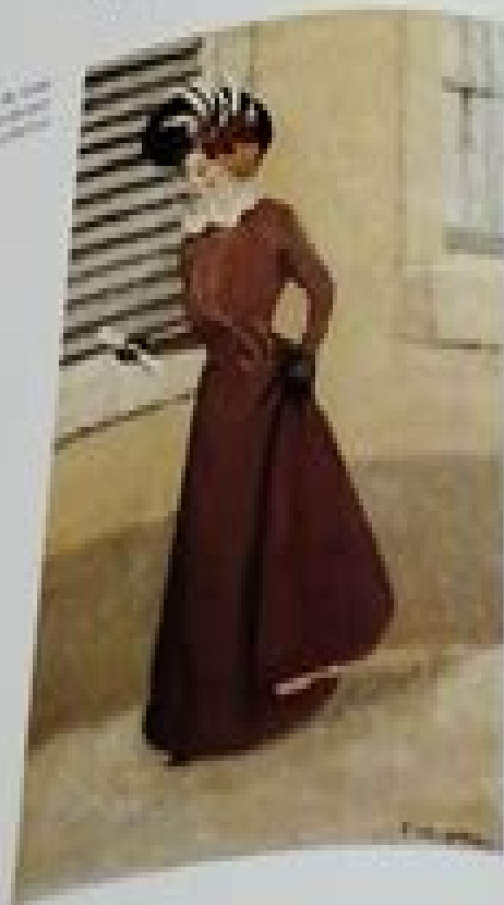
The most popular of the new styles was the 'bustle'...