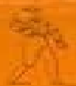
Long Jump High Jump