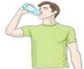
Monitoring Your Hydration