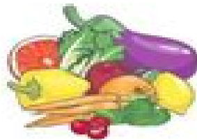
Eating Veggies with Every Meal