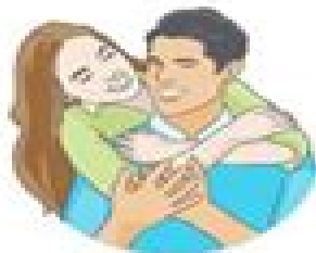
Spending Quality Time with Family/Friends