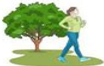
Regularly Spending Time In Nature