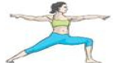
Daily Stretching/ Mobility