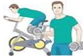
Consistent Exercise Weights + Cardio