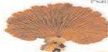
Luminous Pine Bolete