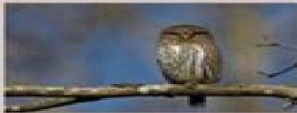
Northern Pygmy Owl