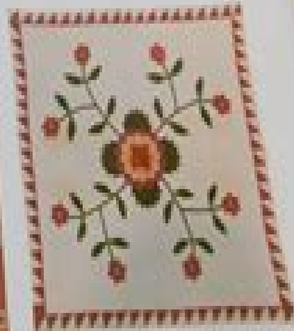
PLATE 17. Wing Bow with hexagonal border, circa 1840. A pineapple has been freely quilted in each square. Pennsylvania. unknown. 11' \times 11'10'' . Cotton. Private collection.