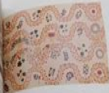
PLATE 13. Lefferts Star , circa 1840. Pennsylvania. unknown. 11' \times 10'10'' . Cotton. Collection of Gloria Lutz. Photograph.