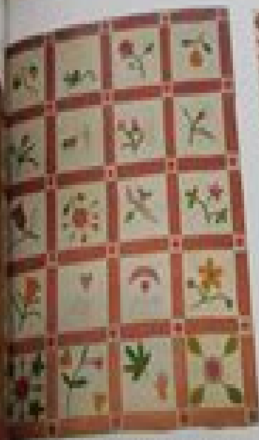
PLATE 16. Green Waves , circa 1870. Pennsylvania. unknown. 11' \times 11'10'' . Cotton. Collection of Gloria Lutz. Photograph.