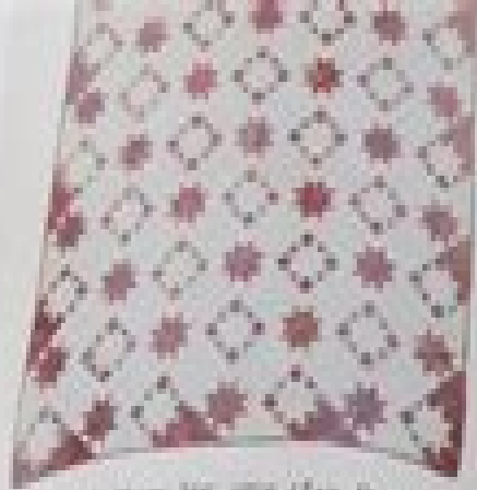
PLATE 11. Lefferts Star , circa 1840. Pennsylvania. unknown. 11' \times 10'10'' . Cotton. Collection of Gloria Lutz. Photograph.