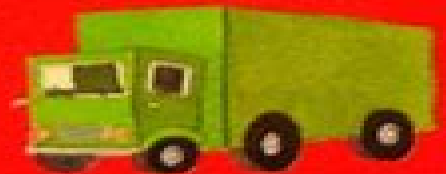
truck el camión