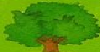
tree el árbol