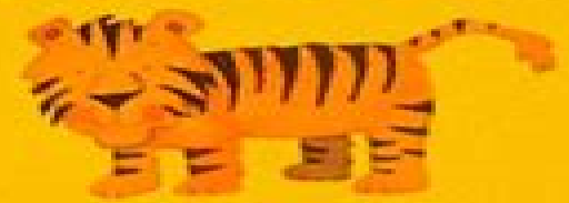
tiger el tigre