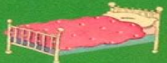
bed la cama