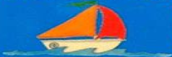
sailboat el velero