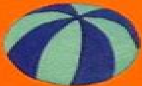
ball la pelota