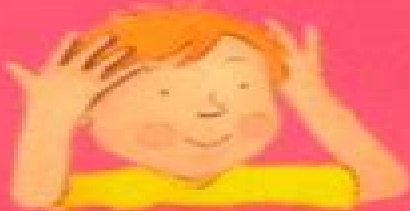
head la cabeza