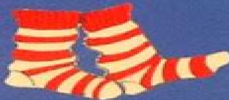
socks los calcetines