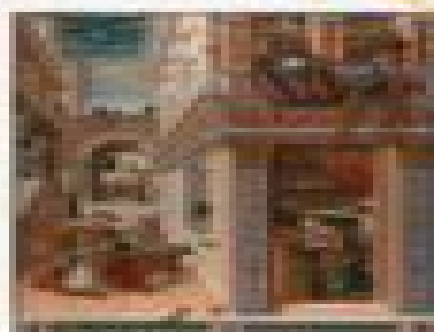
Caro Crivelli, The Annunciation, 1494