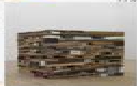
Tony Cragg, Stack 1976