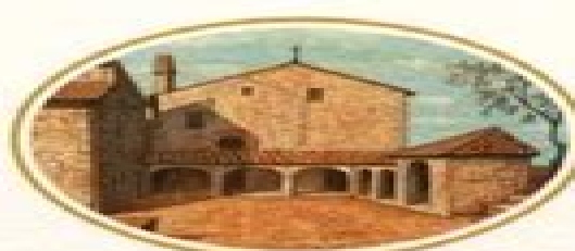
Santuario di San Damiano ASSISI - ITALIA