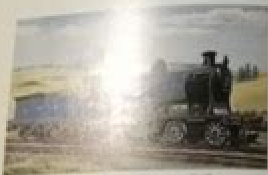
Fig. 1. The Caledonian Railway Co. (1900)