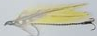
right Yellow Knight Marching Master