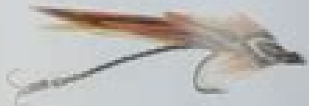
below Brown Knight Marching Club (left)

The 'Marching' or 'Knight' series with various components being tackled and numerous looking pieces - especially for fish that are 'staying short'