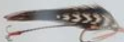
left Black Knight Marching Club