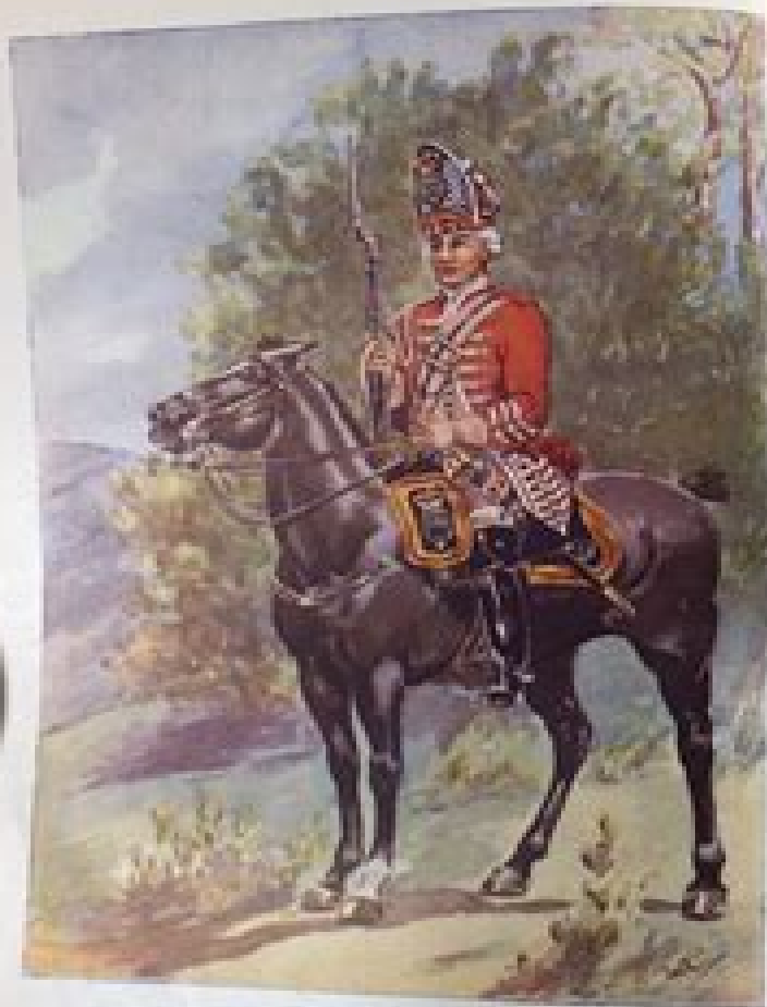
PLATE I THE HORSE GRENADIER GUARDS 1770 FROM THE ORIGINAL

Then uniforms and equipment were a mixture of cavalry and infantry. They wore divided like dragoons but wore the infantry grenadier cap, and carried carbines, pistols, swords, bayonets and pikes. The heavy and light dragoons and the Dragoon Guards were issued with bayonets (presumably a relic of the origin of the former as mounted infantry) and well into the eighteenth century, but it appears that lately they were kept in order.