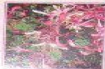
Exciting design ideas

Profuse blooms all year round Exciting design ideas Essential facts for healthy plants Tables of the most popular species