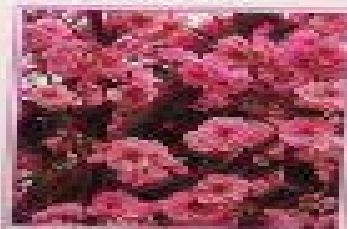
A lot of colour