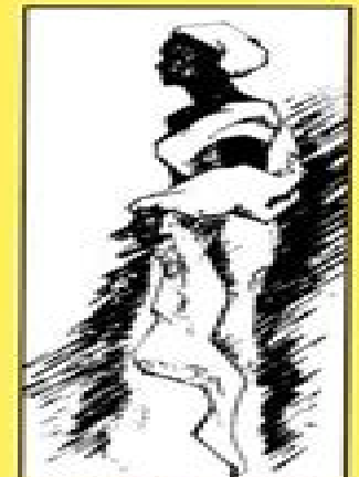
JAFDA AND THE WEDDING