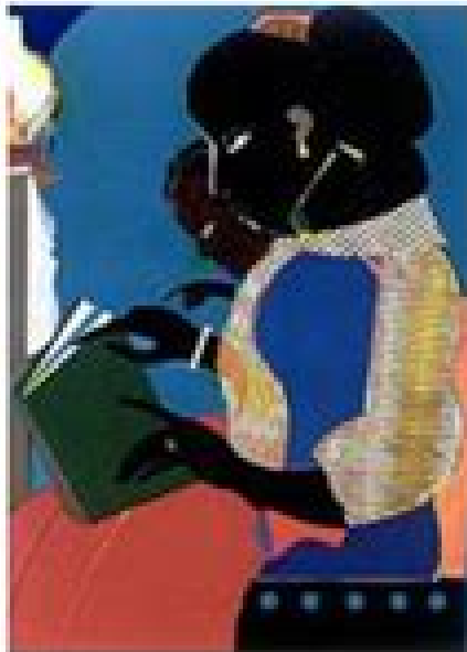
The Lamp , c. 1984 Lithograph commissioned commemorating the 30th anniversary of the U.S. Supreme Court's decision ending official segregation in public education

Artists create to reinforce a shared sense of identity of community, or civilization