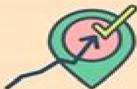
Grow local economies