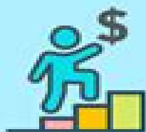
Investing in people