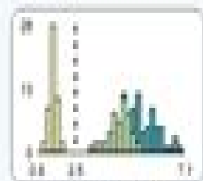
petal length (cm)