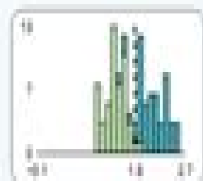
partial widths (sum)