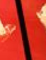
16. VANILLA ICE CREAM TOPPED WITH A CHERRY