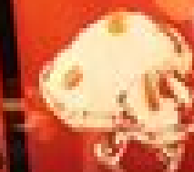
23. VANILLA ICE CREAM TOPPED WITH A CHERRY