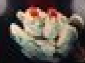
24. VANILLA ICE CREAM TOPPED WITH A CHERRY