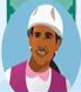
Power plant operator