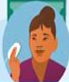
Diagnostic medical sonographer