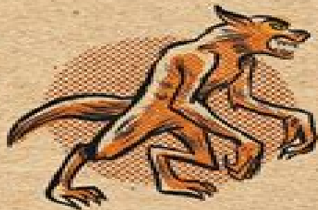
BEAST OF BEAR CREEK