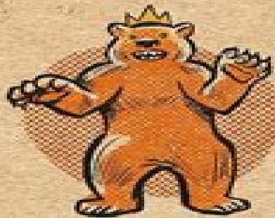
BEAR KING of MARBLE FALLS