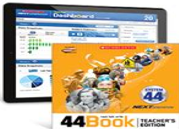
Small-Group Direct Instruction