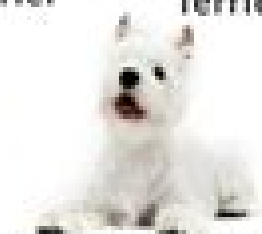
West Highland White Terrier