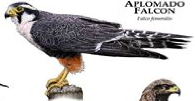
APLOMADO FALCON Falco femoralis