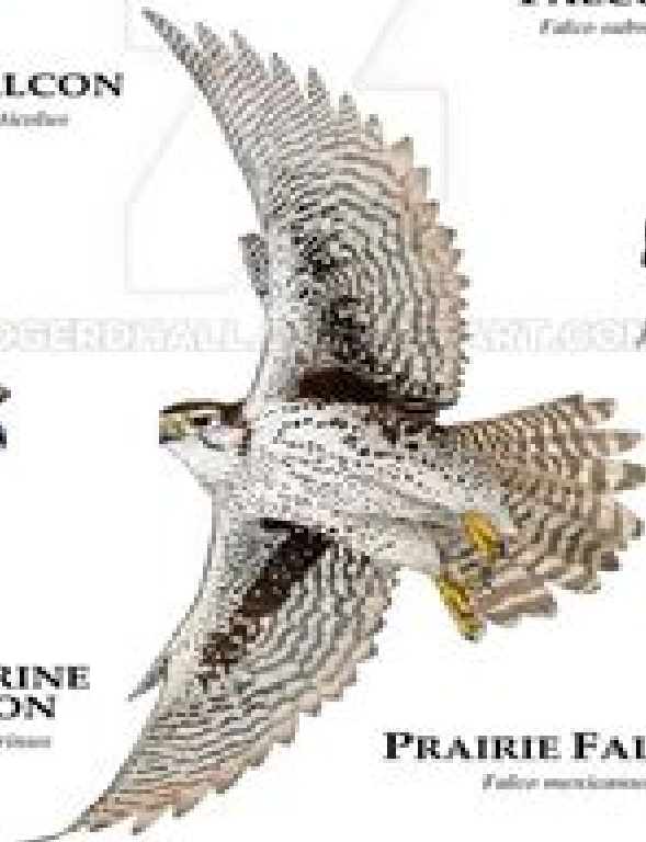
PRAIRIE FALCON Falco mexicanus