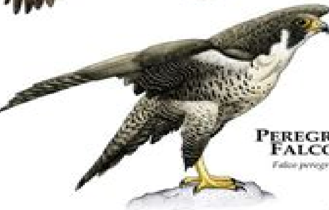
PEREGRINE FALCON Falco peregrinus