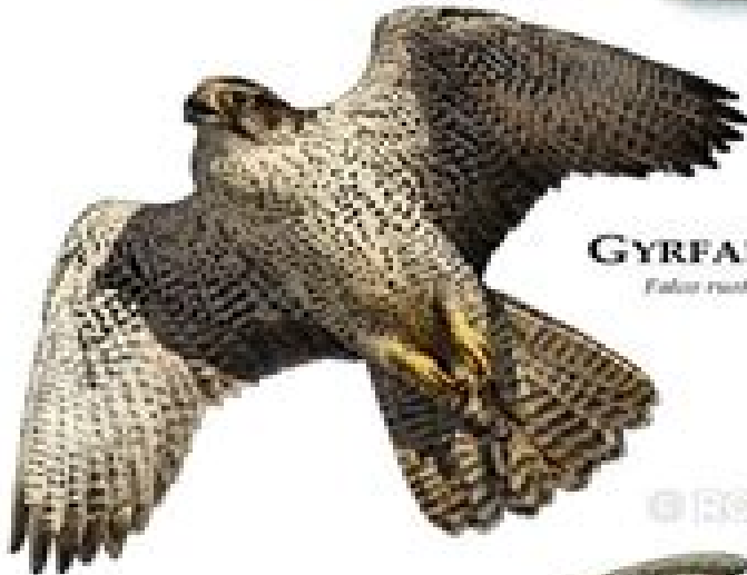
GYRFALCON Falco rusticolus