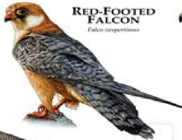
RED-FOOTED FALCON Falco tinnunculus