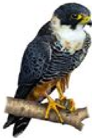
BAT FALCON Falco rufigularis