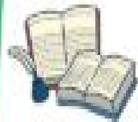
English Language Arts