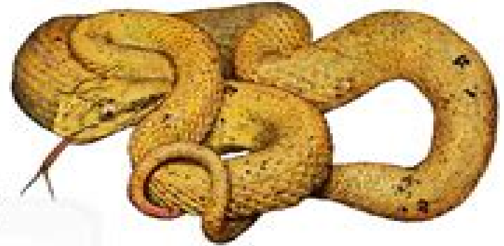
EYELASH PIT VIPER