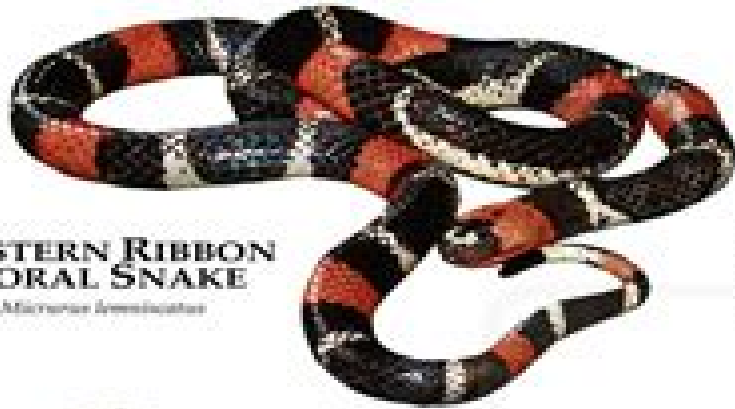
EASTERN RIBBON CORAL SNAKE