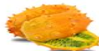
Horned Melon Fruit