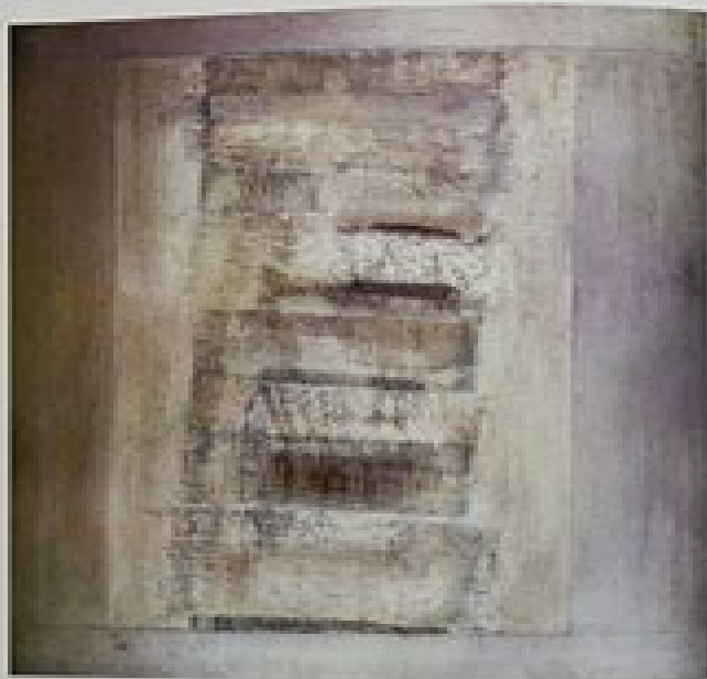
100. The wall of the church in the village of Krasnoyarsk, 1900. The wall is made of stone and is covered with a layer of plaster. The opening is a doorway to the church.