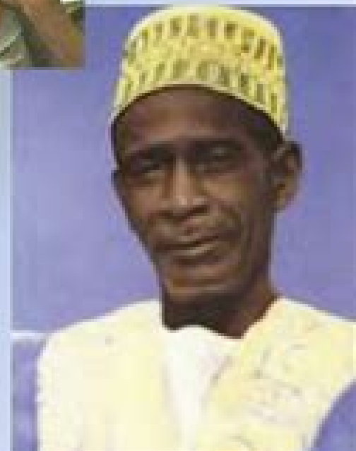
Sir Milton Margai