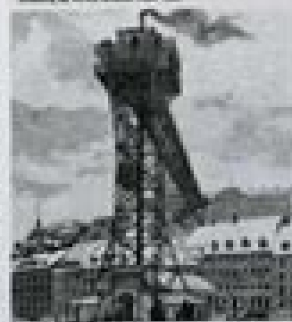
The original Copenhagen urban model from 1846. Building for North Nørre from 1850.

length of buildings around a central urban street measurements with a focus of planned architecture in a rich neo-Renaissance style. The City authorities experienced that the approved plan was adapted when the actual construction work was in the hands of individual building contractors. The work was frequently of a purely speculative nature in order to achieve quick profits.