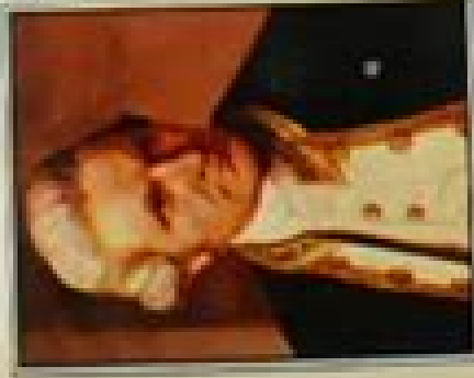
James Cook David Livingston

Stories of Men Who Discovered & Mapped the Uninhabited Areas of the World