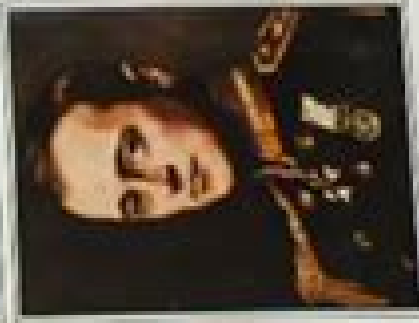
Ernest Shackleton Robert