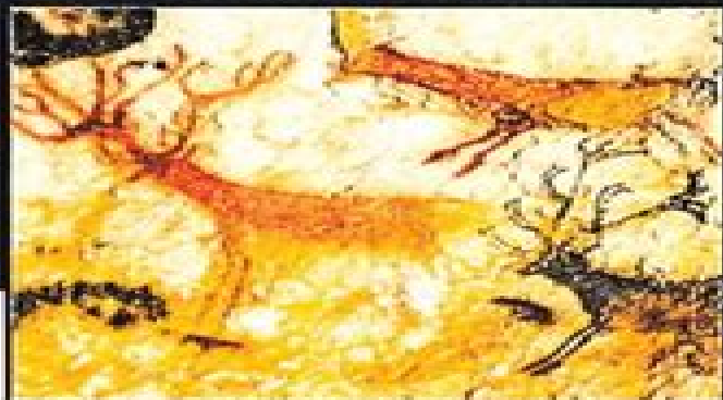
Graffiti - the curse of the modern age.

Tenants of the Lascaux caves in the Dordogne are hopping mad. They've been given two weeks to get out of their homes, all on ac-