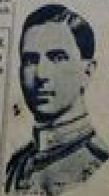
Portrait of a man, likely the subject of the article.

Confidential Sources Are Says by Police That to One—Mason Fitted Burned Inside New New Table Productions