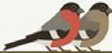
Gimpel Agrostis agrostoides