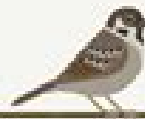
Feldsperling Ficedula montana