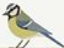
Blauweise Cyanistes caeruleus