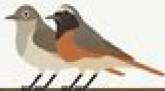
Gartenrotschwanz Merula migratoria