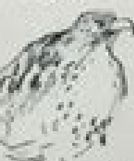
The hawk stayed by the Hill. Stopped to take pictures and she called out. This hawk later she was still there.