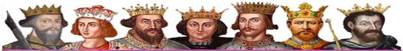
William I - William II - Henry I - Stephen - Henry II - Richard I - John