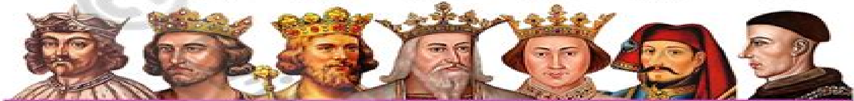
Henry III - Edward I - Edward II - Edward III - Richard II - Henry IV - Henry V