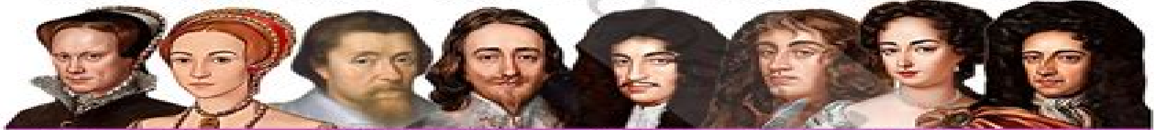
Mary I - Elizabeth I - James VI & I - Charles I - Charles II - James II - Mary II & William III