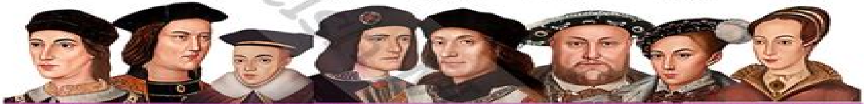
Henry VI - Edward IV - Edward V - Richard III - Henry VII - Henry VIII - Edward VI - Lady Jane Grey