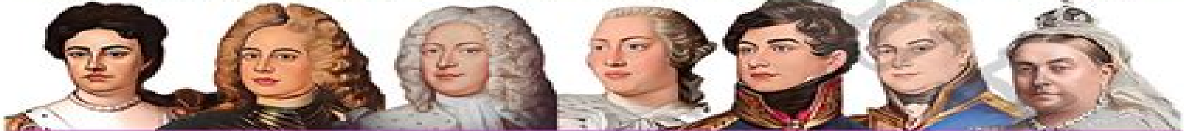
Anne - George I - George II - George III - George IV - William IV - Victoria