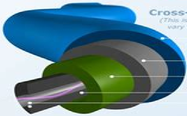
Cross-section of optical fibre cable (This is a generalised description. Specific cable compositions vary dependent upon application.)